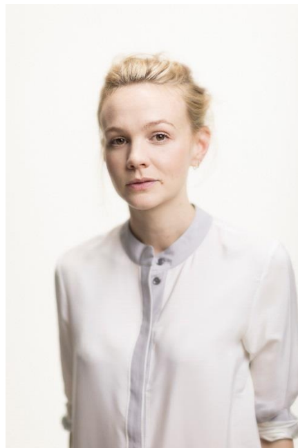
Cast: Carey Mulligan