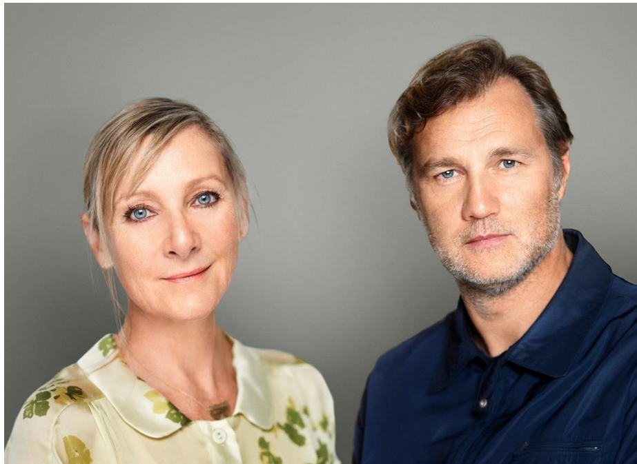
Lead image for the end of history... Lesley Sharp and David Morrissey play husband and wife in Jack Thorne's new play.