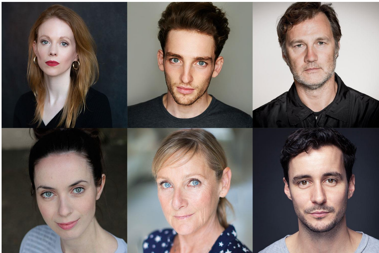
Top row, left to right: Zoe Boyle, Laurie Davidson, David Morrissey Bottom row, left to right: Kate O'Flynn, Lesley Sharp, Sam Swainsbury