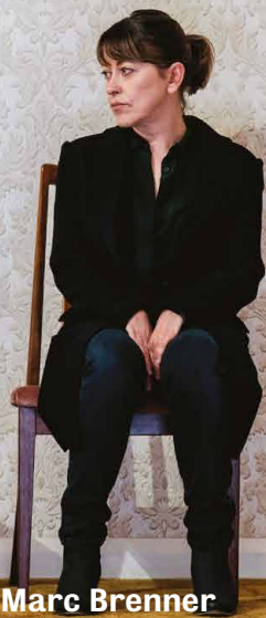
THE CANE by Mark Ravenhill, 2018–19.