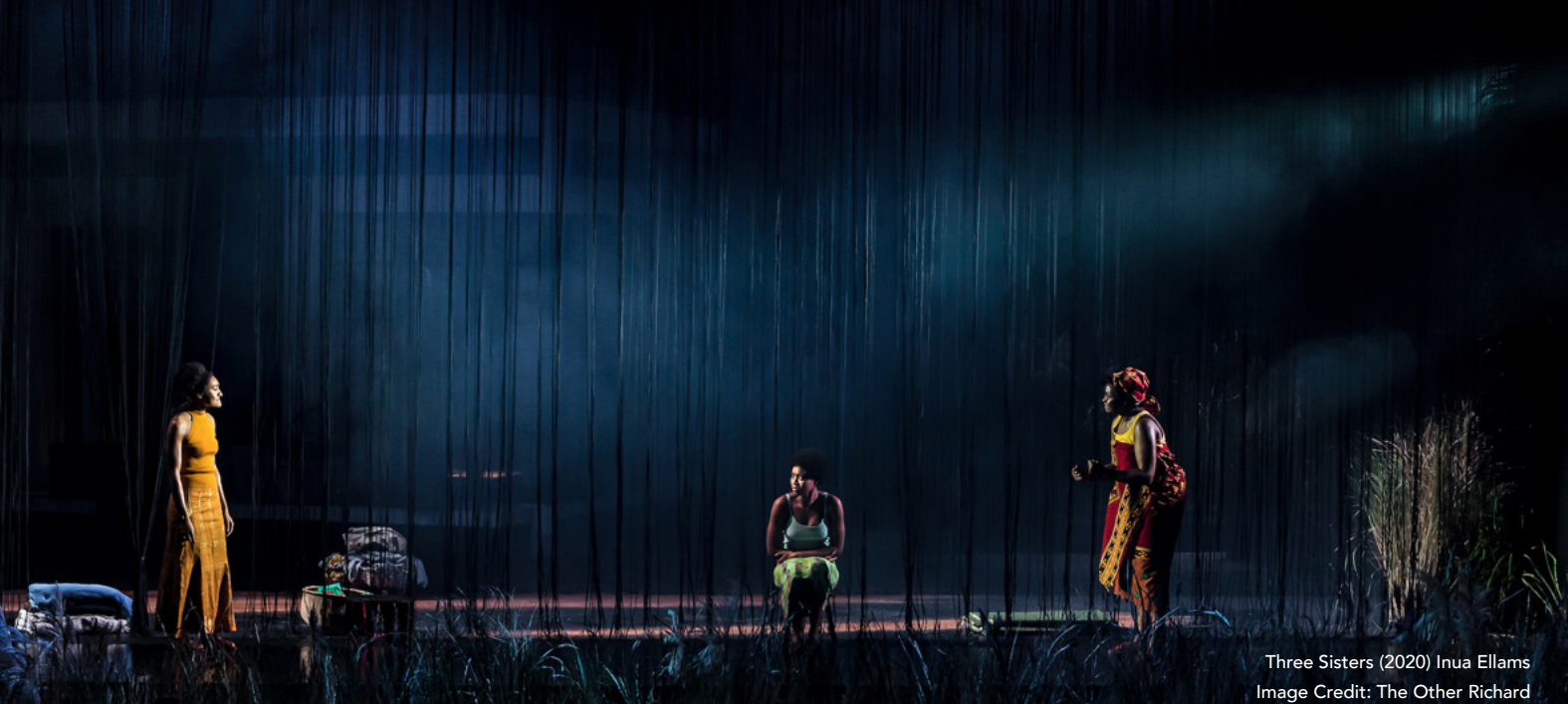
Three Sisters (2020) Inua Ellams