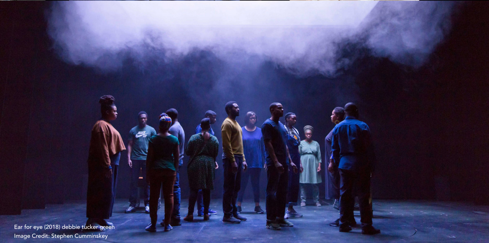
Ear for eye (2018) debbie tucker green