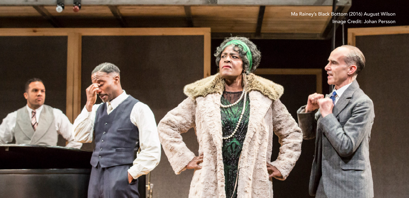
Ma Rainey's Black Bottom (2016) August Wilson