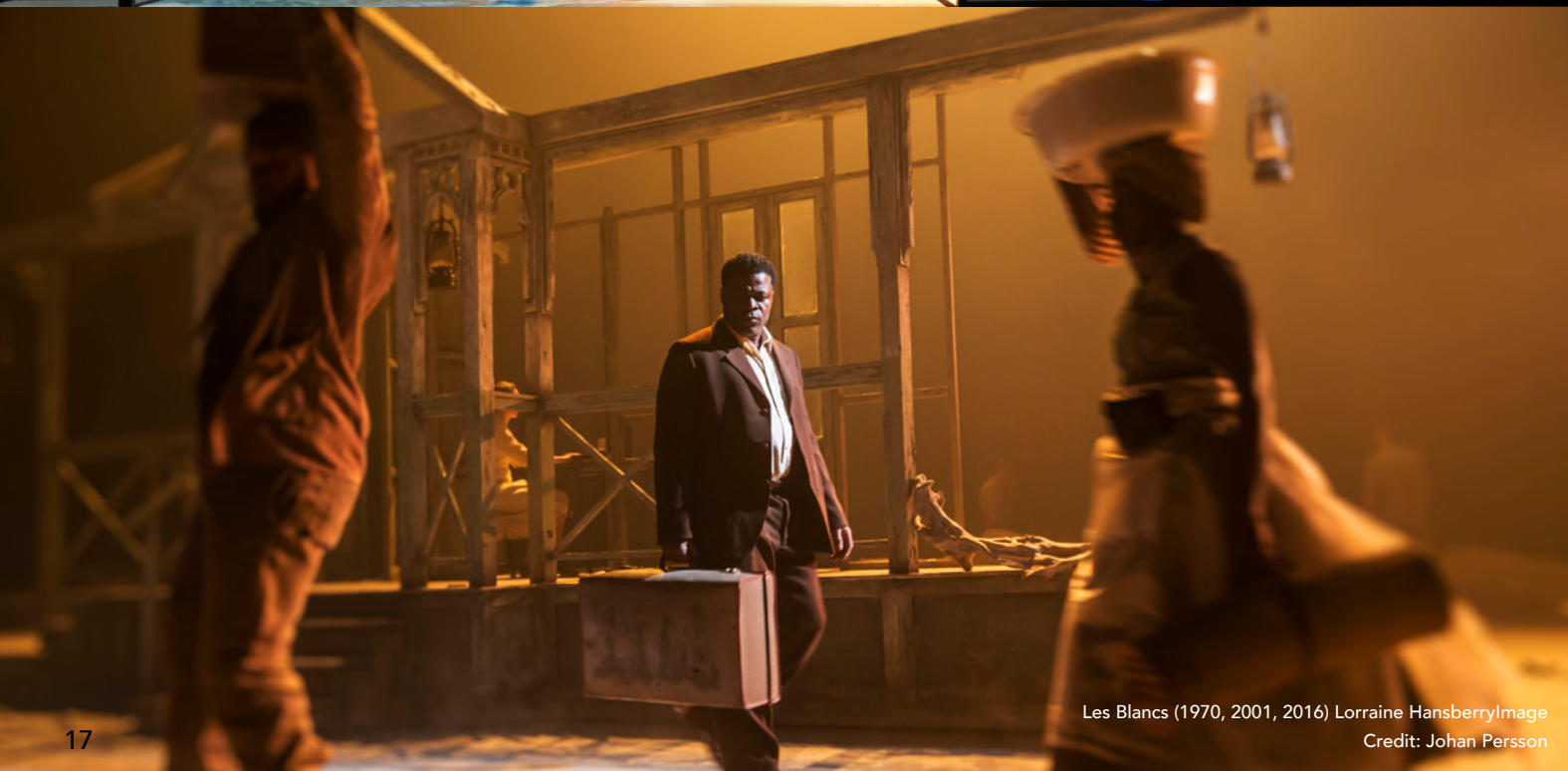
Les Blancs (1970, 2001, 2016) Lorraine Hansberry