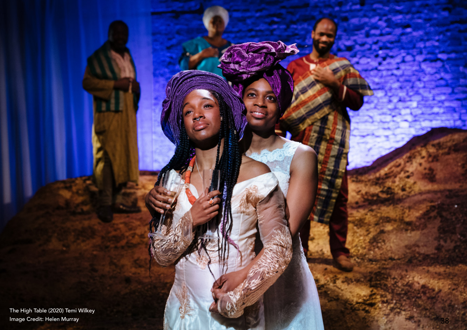
The High Table (2020) Temi Wilkey