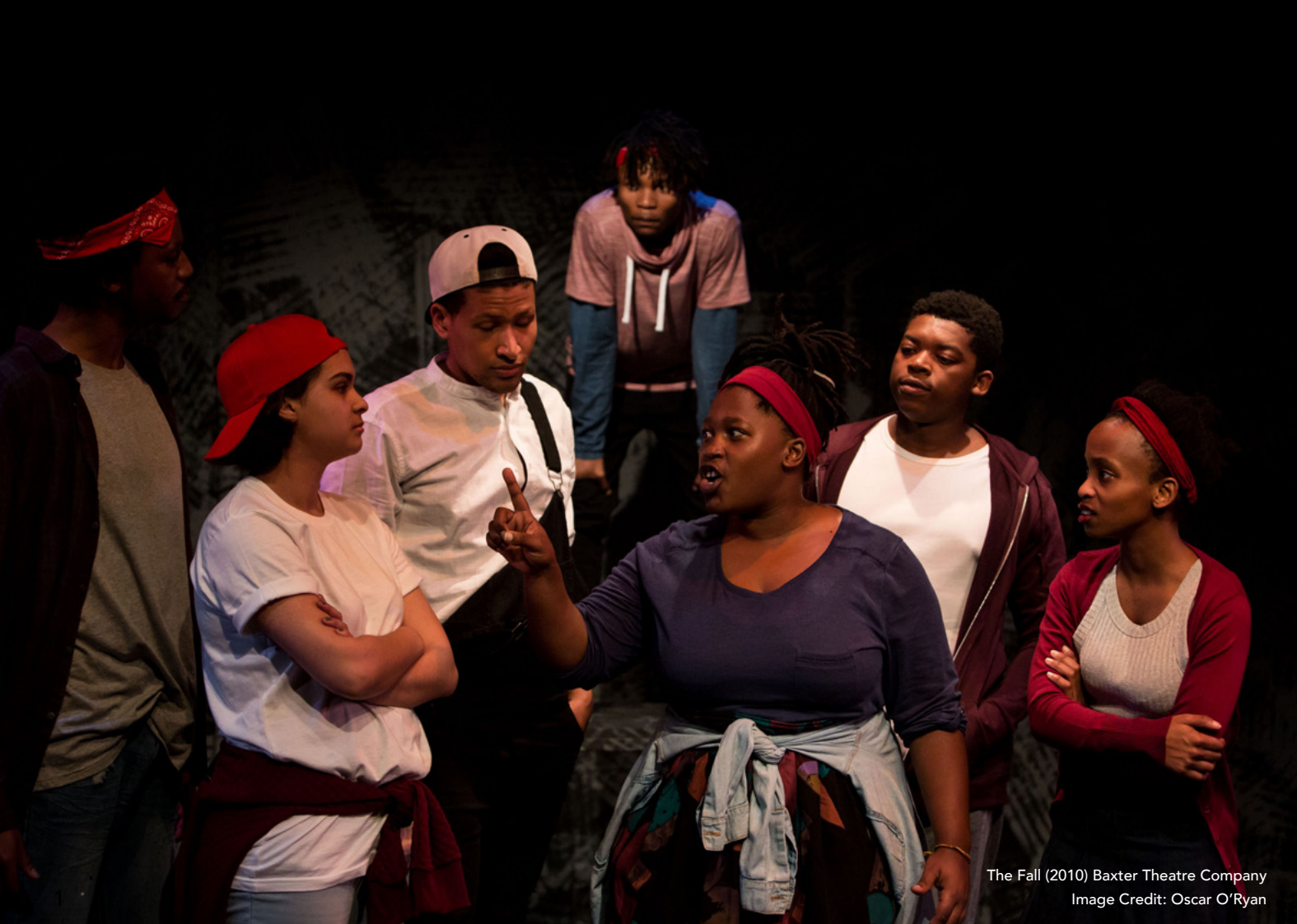
The Fall (2010) Baxter Theatre Company