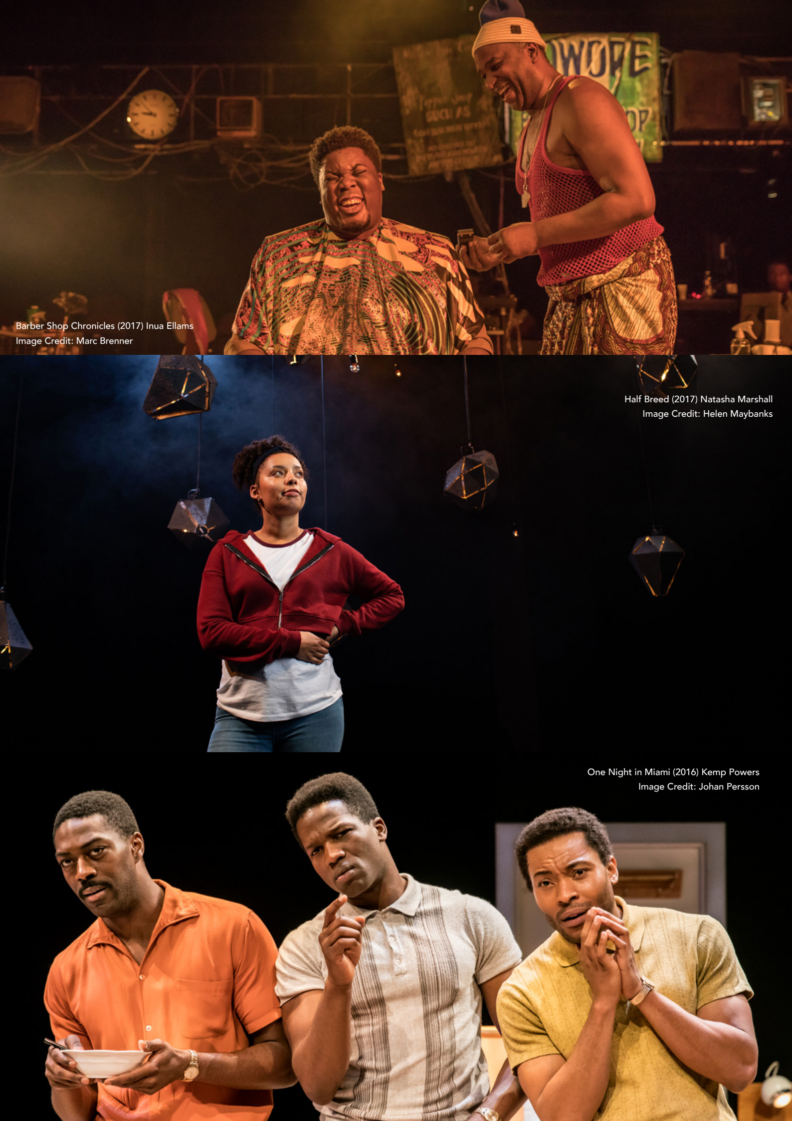
Barber Shop Chronicles (2017) Inua Ellams