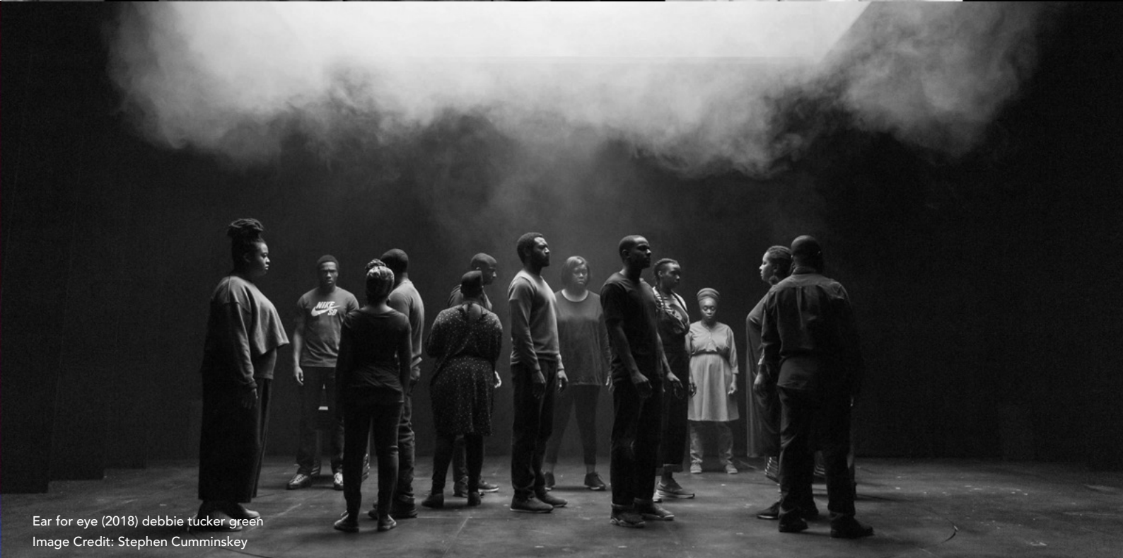
Ear for eye (2018) debbie tucker green