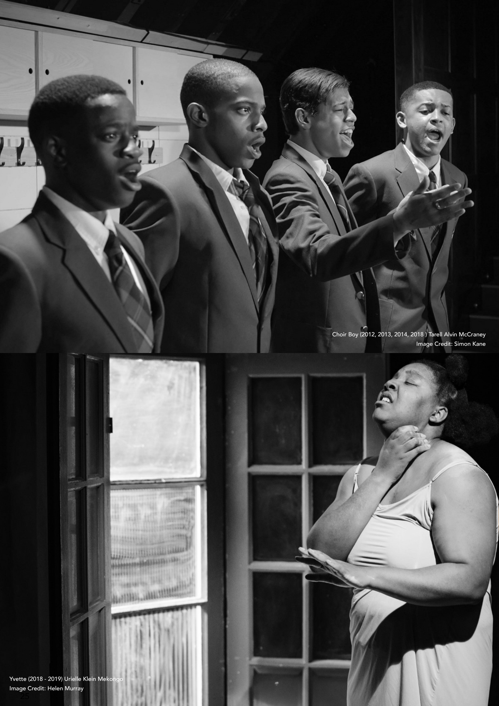
Choir Boy (2012, 2013, 2014, 2018) Tarell Alvin McCraney