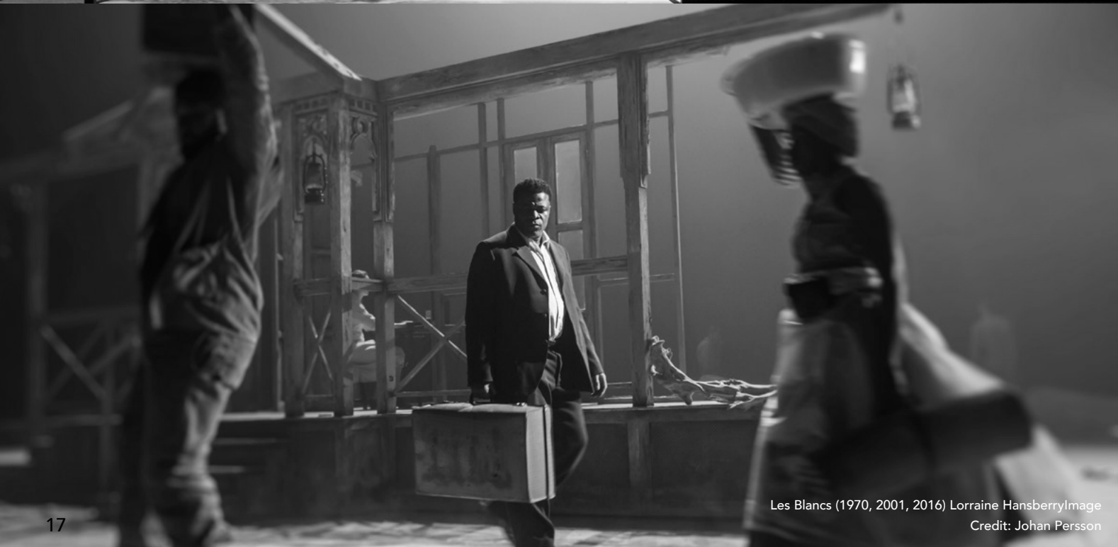
Les Blancs (1970, 2001, 2016) Lorraine Hansberry