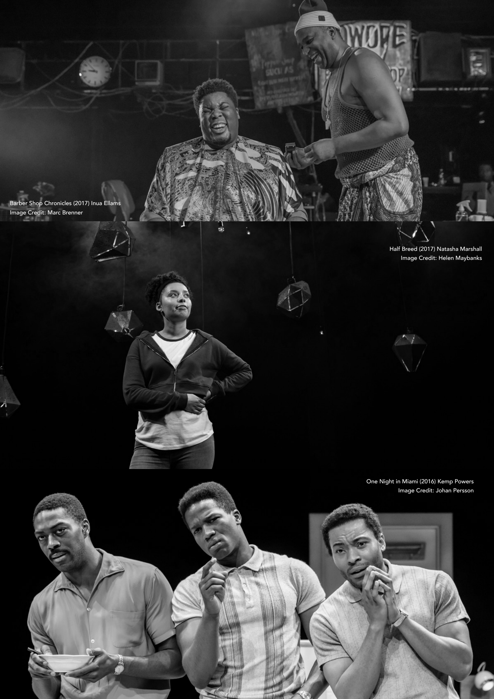
Barber Shop Chronicles (2017) Inua Ellams