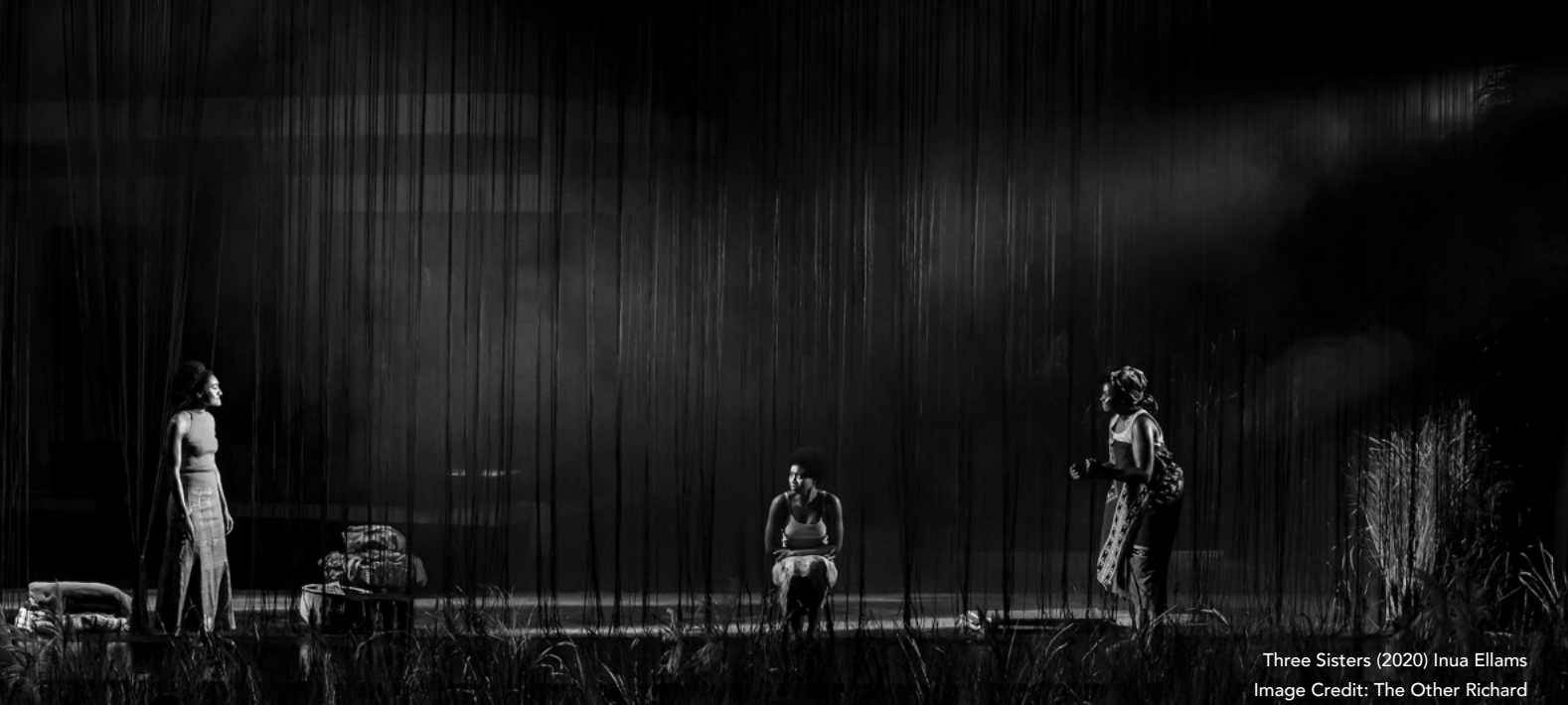
Three Sisters (2020) Inua Ellams