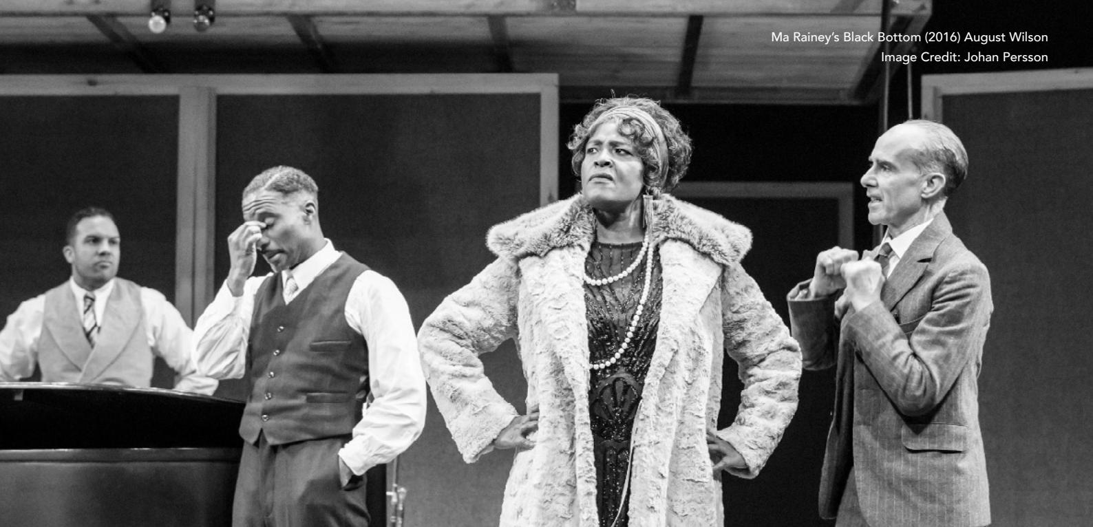
Ma Rainey's Black Bottom (2016) August Wilson