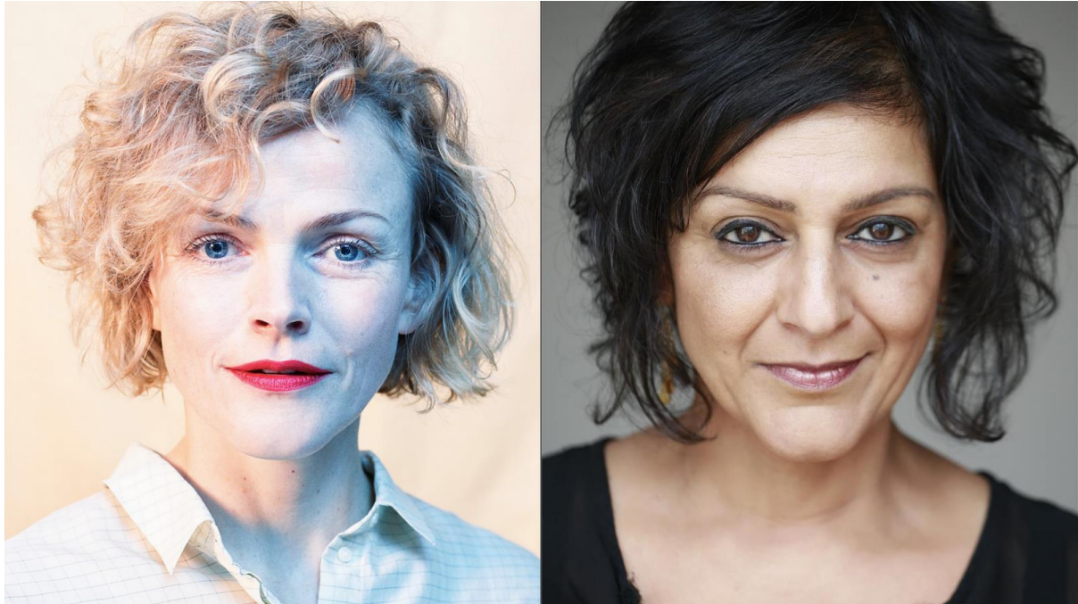
Photo credit: Maxine Peake (BP Photography), Meera Syal (Simon Annand).