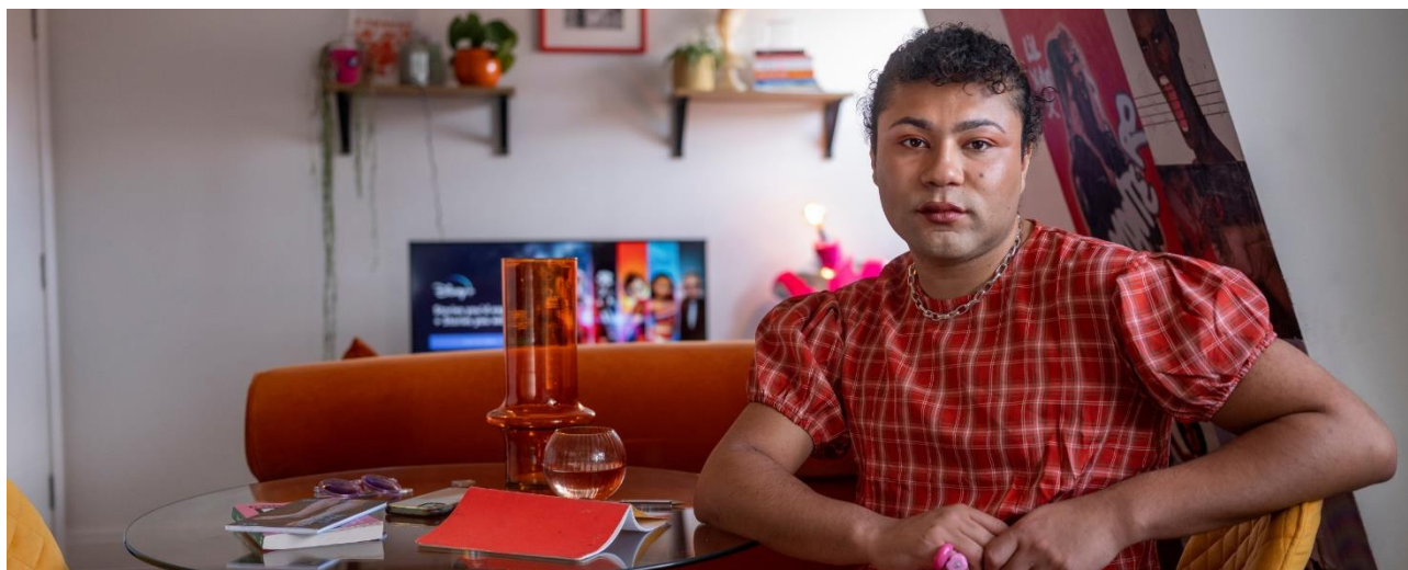
image of Travis Alabanza

https://royalcourttheatre.com/whats-on/sound-of-the-underground/