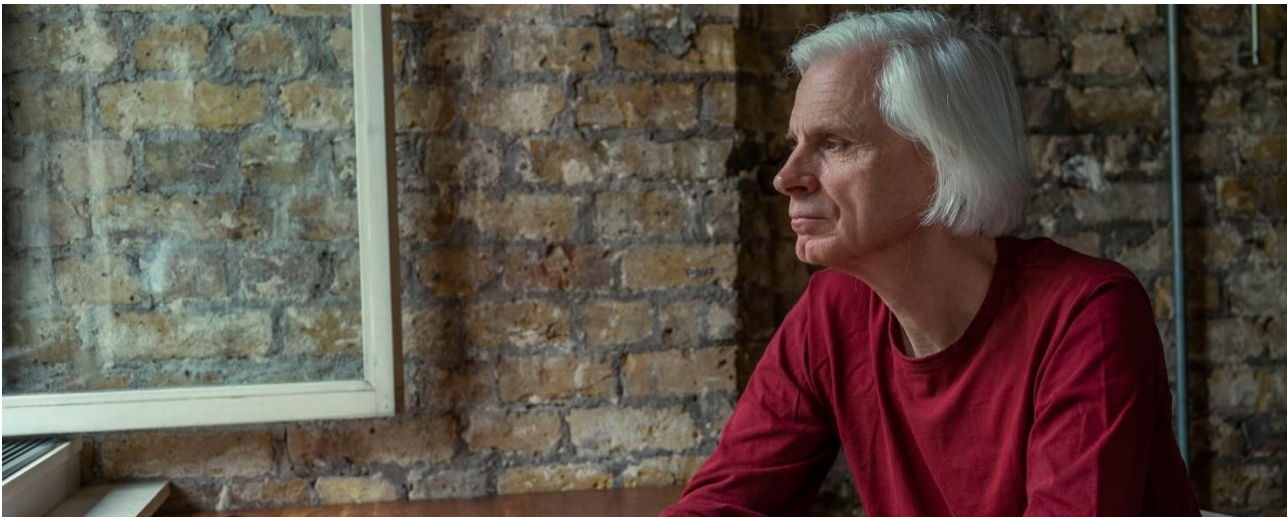
image of Martin Crimp

https://royalcourttheatre.com/whats-on/not-one-of-these-people/