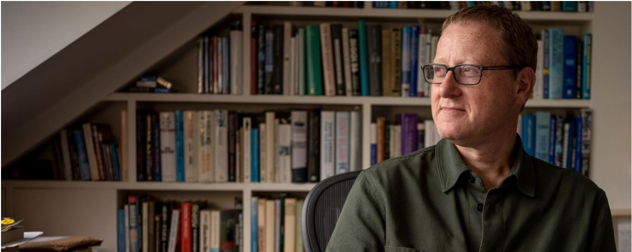
image of Jonathan Freedland

https://royalcourttheatre.com/whats-on/jews-in-their-own-words/